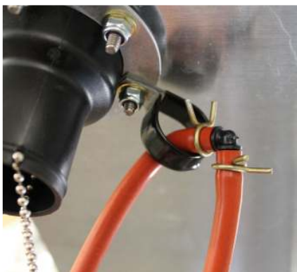
SET UP LIKE THIS